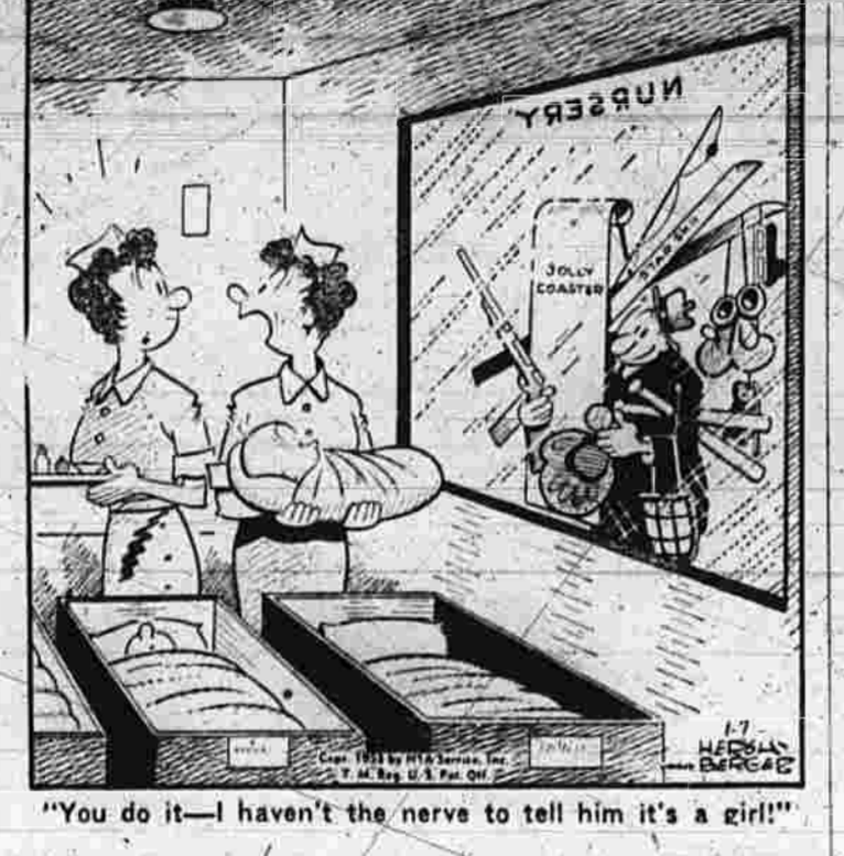
BY MAJOR HOOPLE