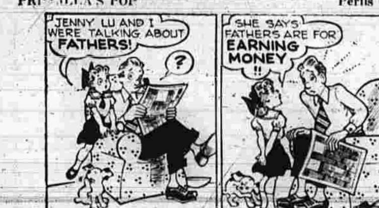
BY AL VERMEER