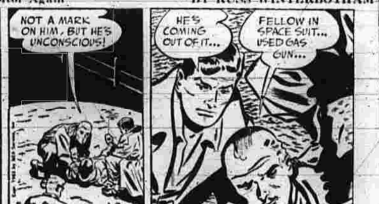
BY RUSS WINTERBOTHAM