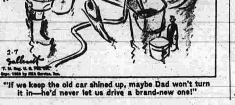
BOOTS AND HER BUDDIES