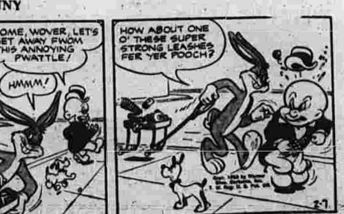
COME, HONOR, LET'S GET AWAY FROM THE PAST!