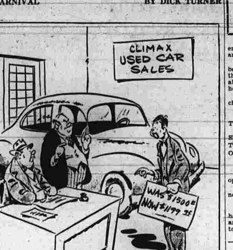
CLIMAX USED CAR SALES