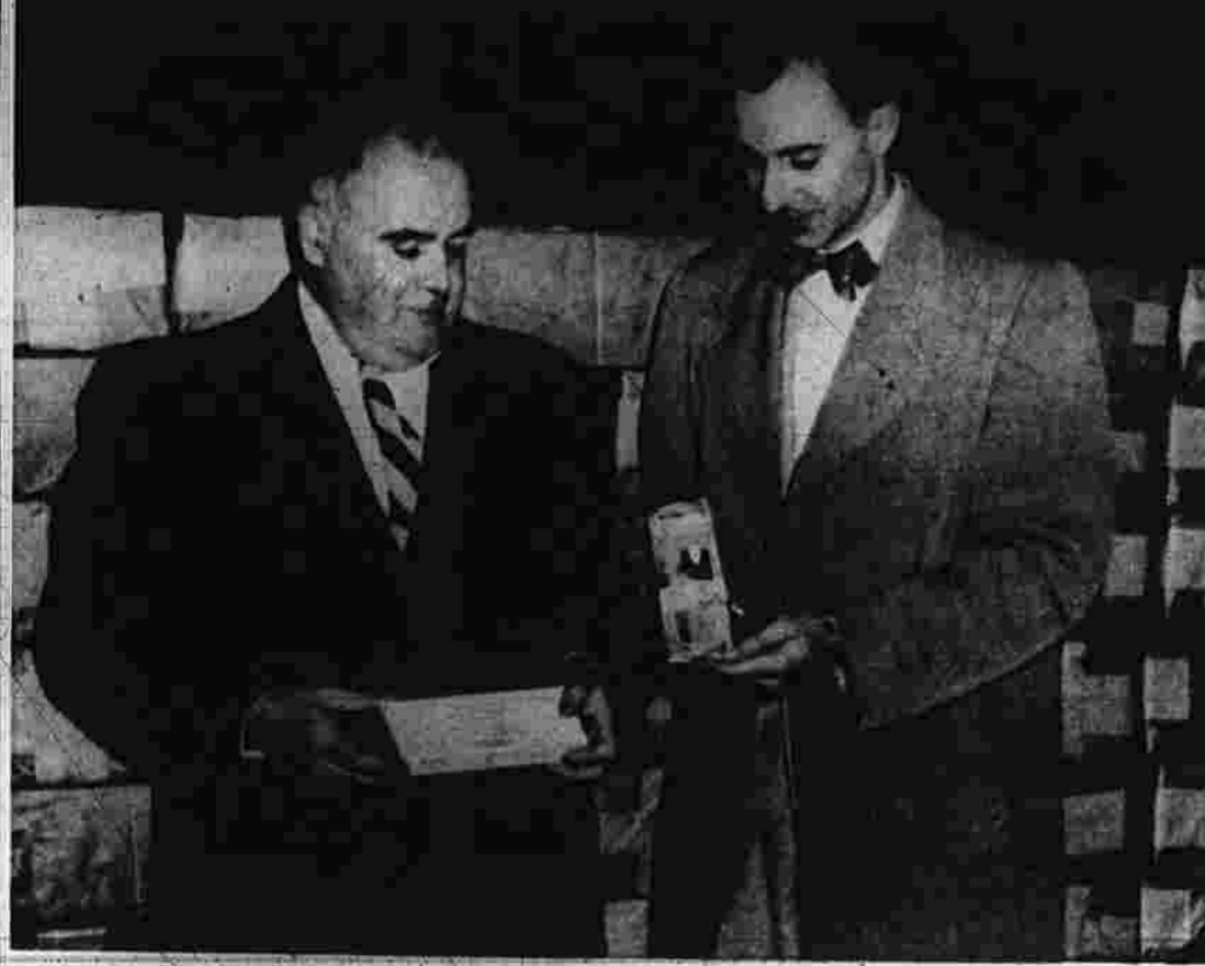
First Shipment of Medical Supplies Arrives Here

(Continued from Page One) snow in the Bronx and in suburban Westchester County.