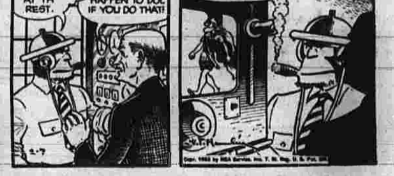
Which Is Worse?