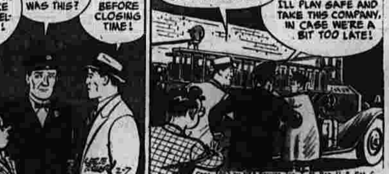
They Know That Mud