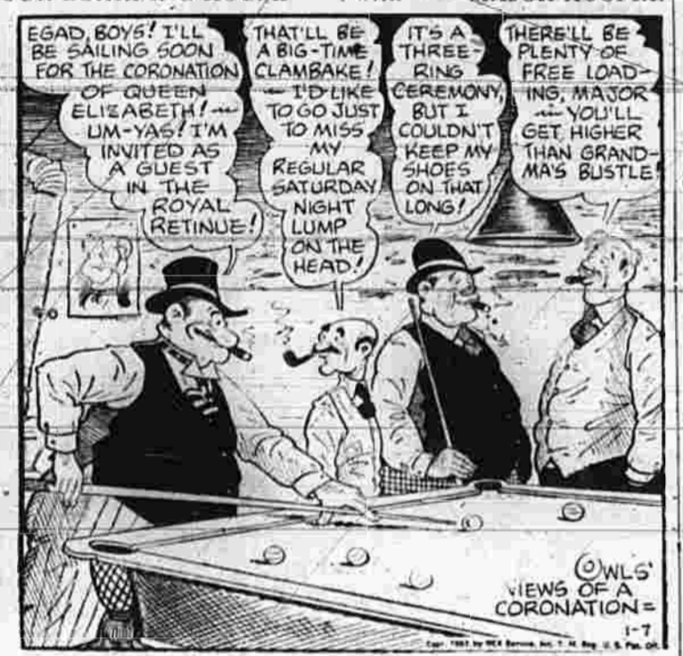
BY MAJOR HOOPLE